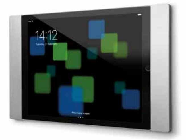
Illustration with iPad Pro