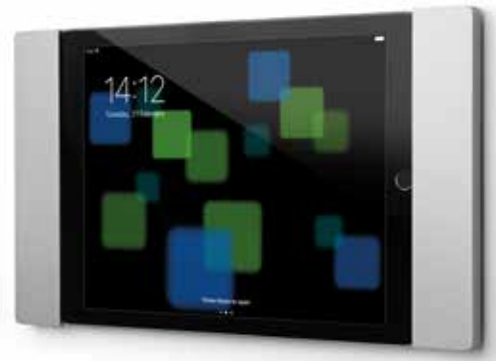
Illustration with iPad Air